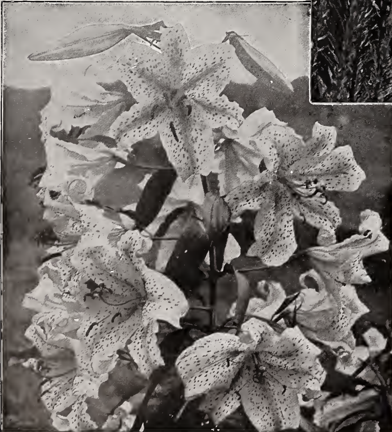
Lilium auratum (Golden-rayed Lily of Japan)